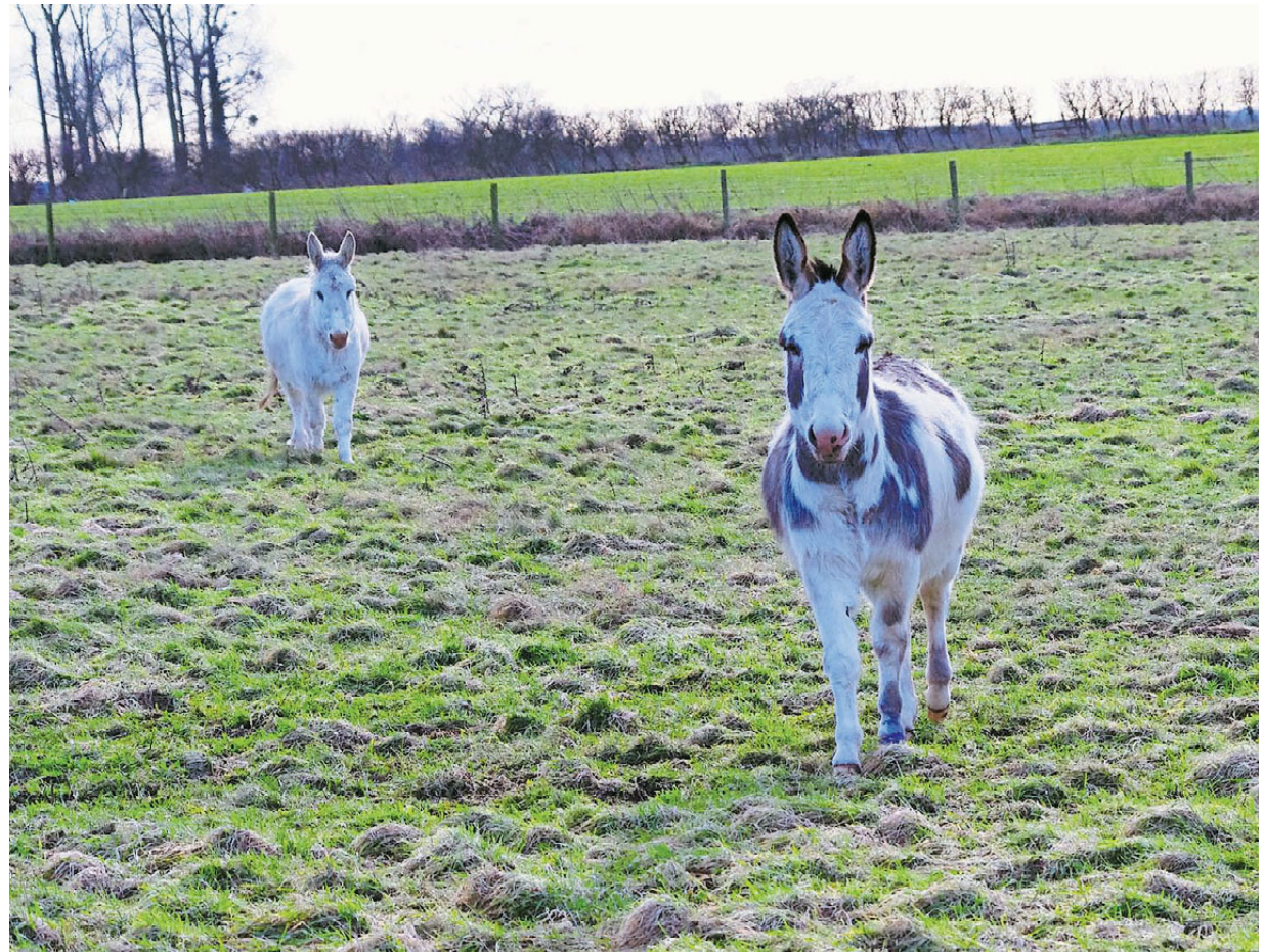
■ These curious donkeys caught sight of Tom Newell in their field at Aldeby and decided to wander over – just in case. If you would like to submit a picture for possible publication in the EDP, visit www.iwitness24.co.uk .