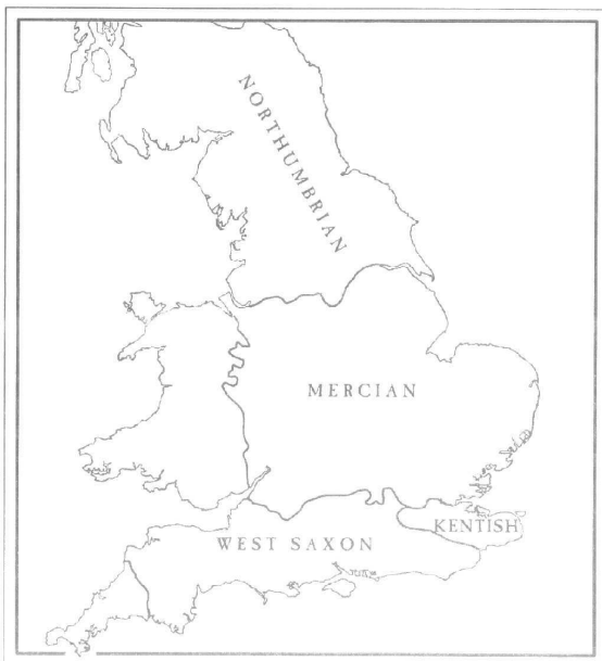
Illustration IOE dialects

Liber querulus de excidio Britanniae , was written c. 548 and is ascribed to Gildas - the earliest writer to attempt a narrative of events in Britain from the latter part of the Roman period until the latter part of the Anglo-Saxon invasion period. His story could be summarized as follows. There is a threat of invasion of the island from the north. A 'proud tyrant' ( superbus tyrannus ), unnamed by Gildas, invites Saxons to help to repel the invasion. Three shiploads of them land somewhere in the eastern part of Britain and are given land there to settle in exchange for providing the defense of the country. These are later followed by further contingents who also settle and perform the same mercenary functions. After some time the Saxons revolt against the British, fight against them and destroy much of the country. After prolonged fighting, the British finally defeat their former defenders at Mons Badonicus and establish the period of peace and prosperity which Gildas himself witnessed.