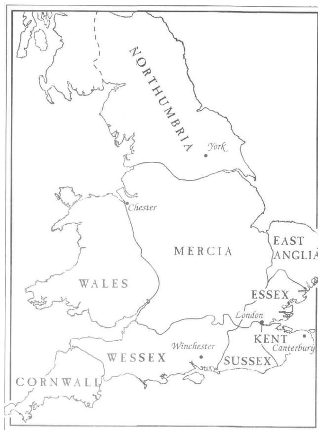
Illustration 2 Anglo-Saxon Heptarchy