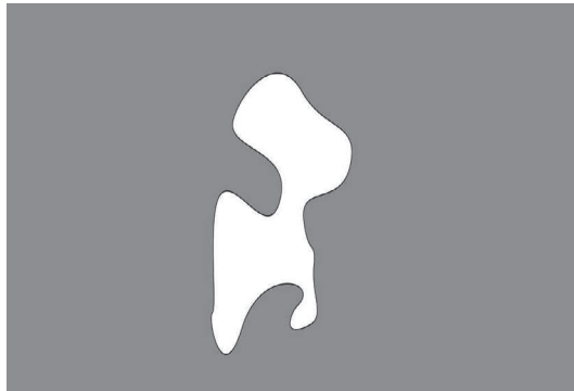
Figure 1. Sample object used in the rotation experiment.