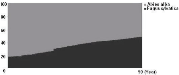
Fig. 4. Changes in the proportion of biomass of tree species in the studied tree stand forecasted by the model FORKOME (X-axis – year of simulation, Y-axis – a proportion of tree species in the biomass).

The analysis of tree stand development within a single patch cannot reflect the full picture of forest development dynamics, which is a larger area consisting of many patches. In such case, more credible results can be obtained with application of cellular automata in the form of CELLAUT model.