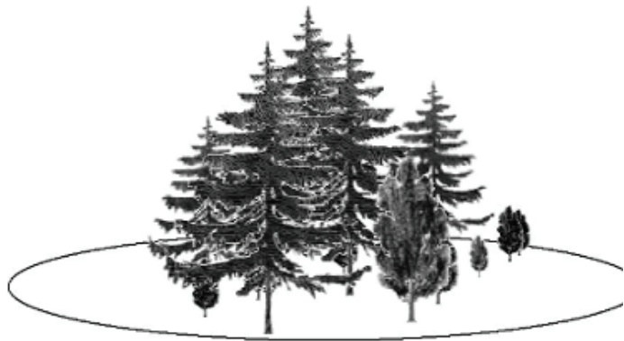
Fig. 2. Initial picture of simulated area in the model FORKOME (prior to the simulation).