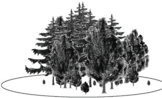
Fig. 3. Final picture resulting from simulation in the model FORKOME.

In subsequent years of simulation, the proportion of beech trees (regarding the biomass) within an analysed area increases gradually but continuously from about 20% in the beginning, up to about 50% in the last year of simulation (Fig. 4).