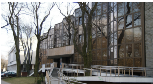
Collegium Norvidianum - CN