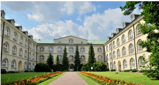
University main building - GG

Collegium Joannis Pauli II (C) : the heart of the English Philology is located on the 9th floor (there are also classrooms on the ground floor and 1st floor; room numbers that start with C- ); You may find the Institute Head's office (C-949), the Institute Secretary's office (C-942); teachers' offices and the Institute's library (C-911) here.