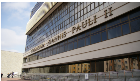
Collegium Joannis Pauli II - C