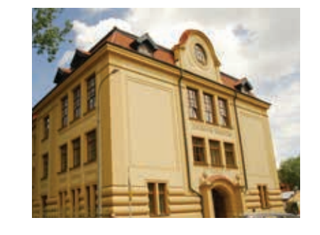
And beyond the city centre:

Collegium Iuridicum, Spokojna Street (approx.10 minutes on foot)