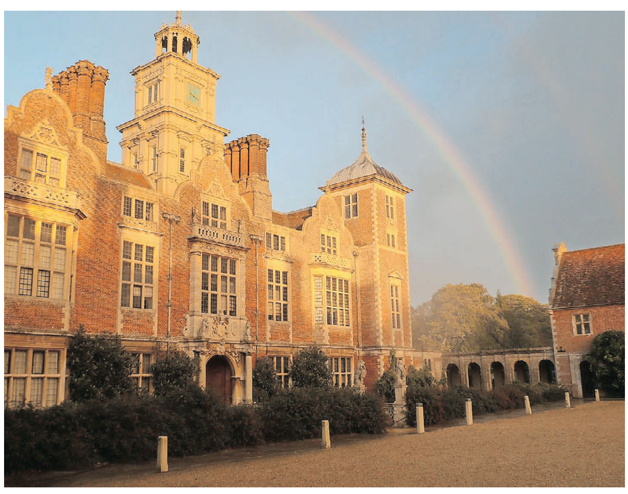
■ Blickling Hall is bathed in a golden light under a double rainbow. If you would like to submit a picture for possible publication in the EDP, visit www.iwitness24.co.uk