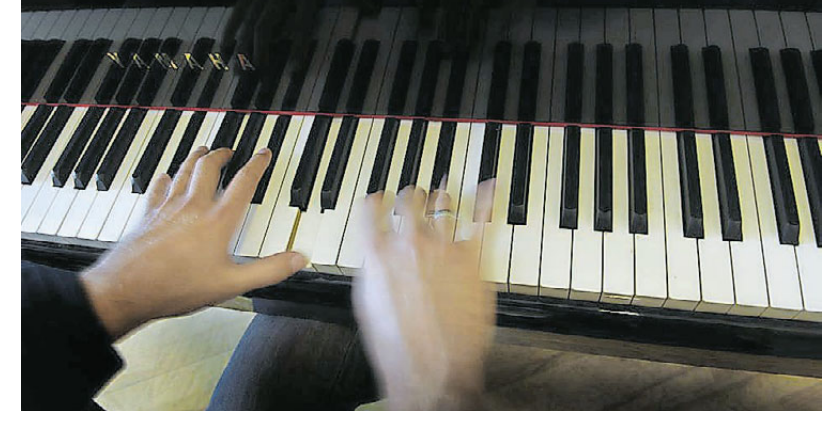
■ So have you guessed what a 'pairnist' is, Advanced Spoken Norwich students?

We will begin with a little test. Consider the word 'vehicle'. Is your mastery of the rule good enough to work out how to achieve the right pronunciation