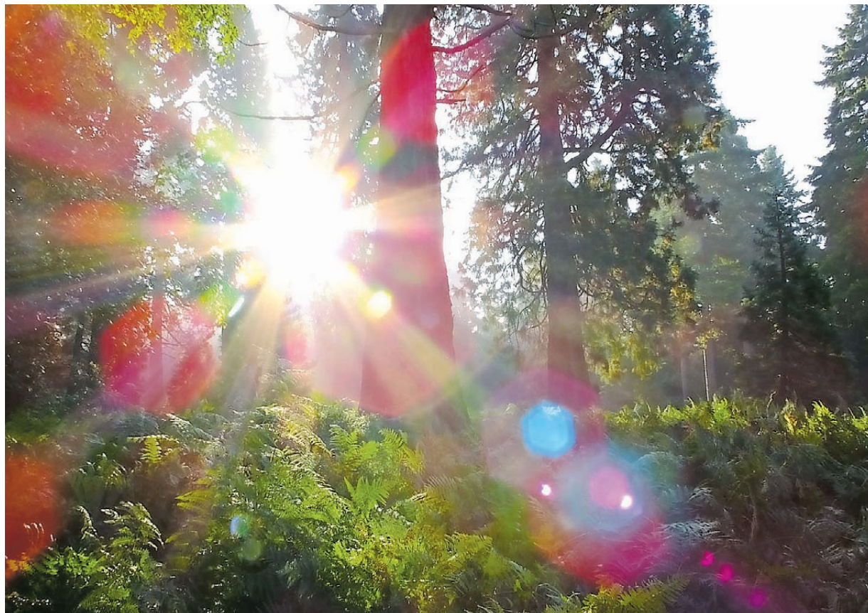
Lee Ackers captured this photograph of the autumnal sun's rays breaking through the trees during a cycle ride in Thetford Forest. If you would like to submit a picture for possible publication in the EDP, visit www.iwitness24.co.uk