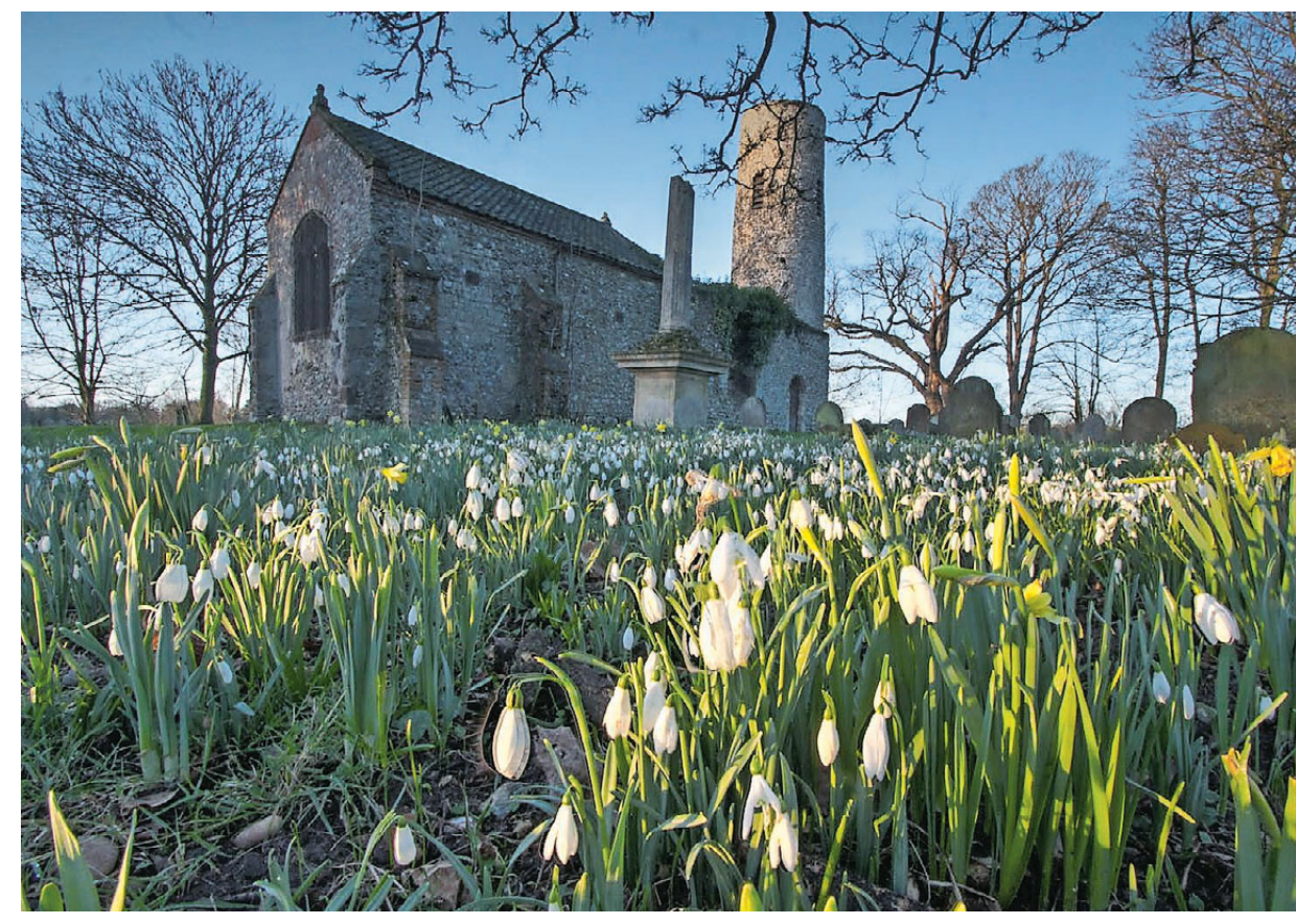
A carpet of snowdrops at St Theobald's Church, Great Hautbois. If you would like to submit a picture for possible publication in the EDP, visit www.iwitness24.co.uk